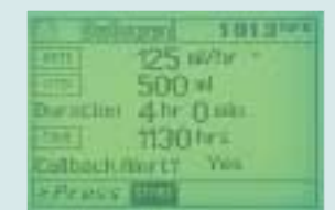
Programmable Start Time