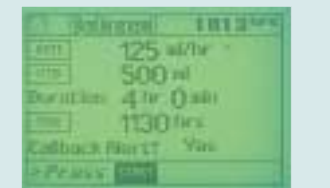
Programmable Start Time